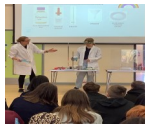
St Helena came into school this morning to do some experiments with our Year 6... 'Rainbow Mixing' and 'Ethanol in a plastic barrel. Best ask the Year 6—I have no idea!

Gertrude Elion - Born in 1918, she was a Nobel winner who developed drugs to treat leukemia and prevent kidney transplant rejection.