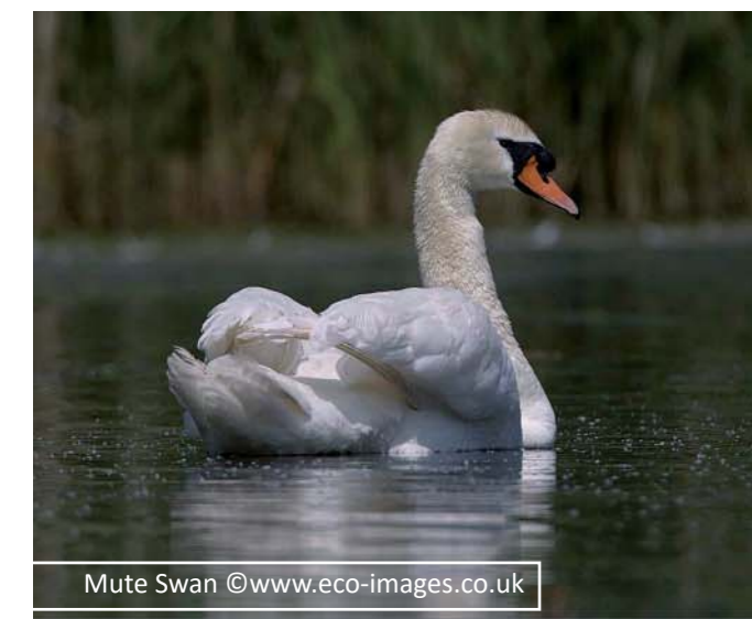
Mute Swan